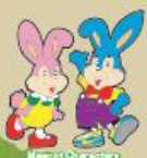
Hana-chan Kai-kun Mascot Characters

Hizashi Seaside Park is located on the Pacific Ocean side of the Japanese coast, and incorporates a unique natural environment of sand dunes, forests, grasslands and water. With a total space of 350 hectares, of which 237 hectares are open to the public, the huge seaside park is home to a variety of colorful flowers and grasses throughout the four seasons, as well as numerous other attractions, including an amusement park, large greenery, cycling and BMX tracks, a forest shelter field, BBQs, strolling by ricksha, and many cafes and restaurants.