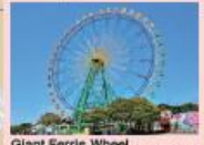
Giant Ferris Wheel Giant Ferris Wheel is a symbol of the park. Enjoy the far side in the sky for 15 minutes. The size at the height of 100m offers a splendid panorama. When out in the park, the wheel will always help you find your present location.